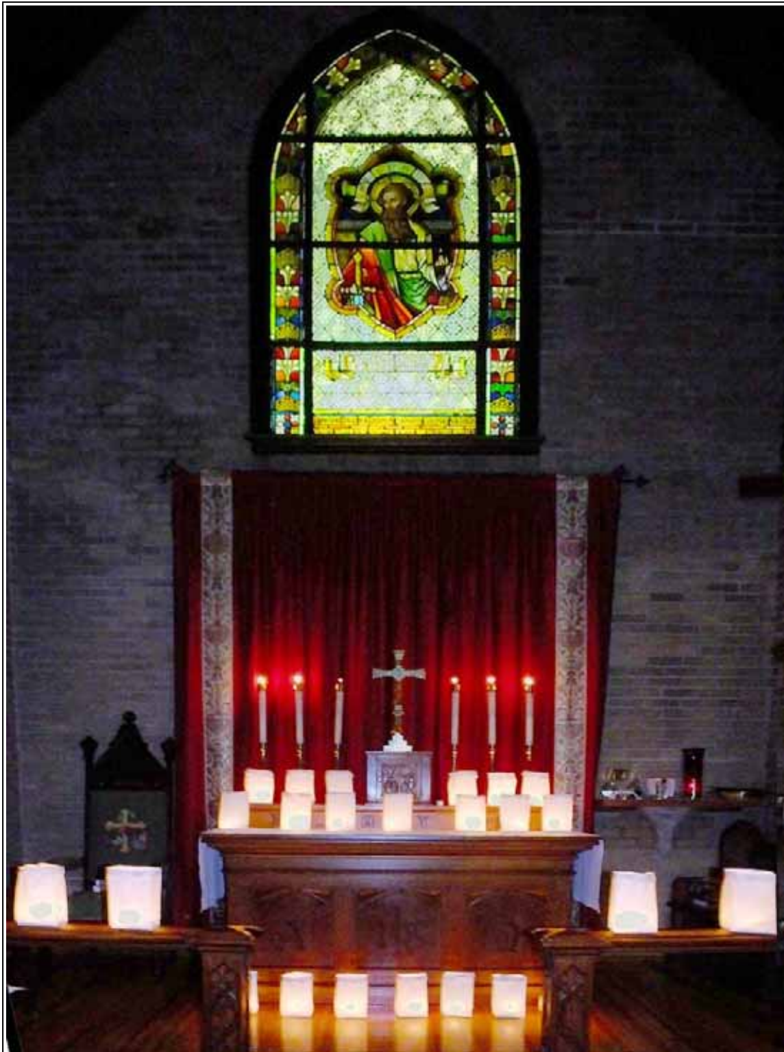
Luminaries Cast a Special Ambiance as Loved Ones are Remembered