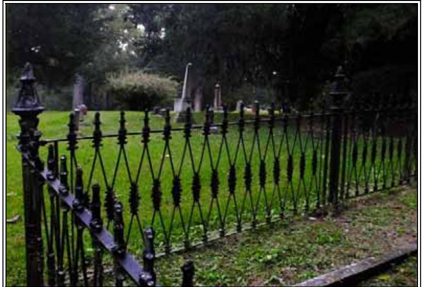
Iron paling adds a touch of beauty to cemetery