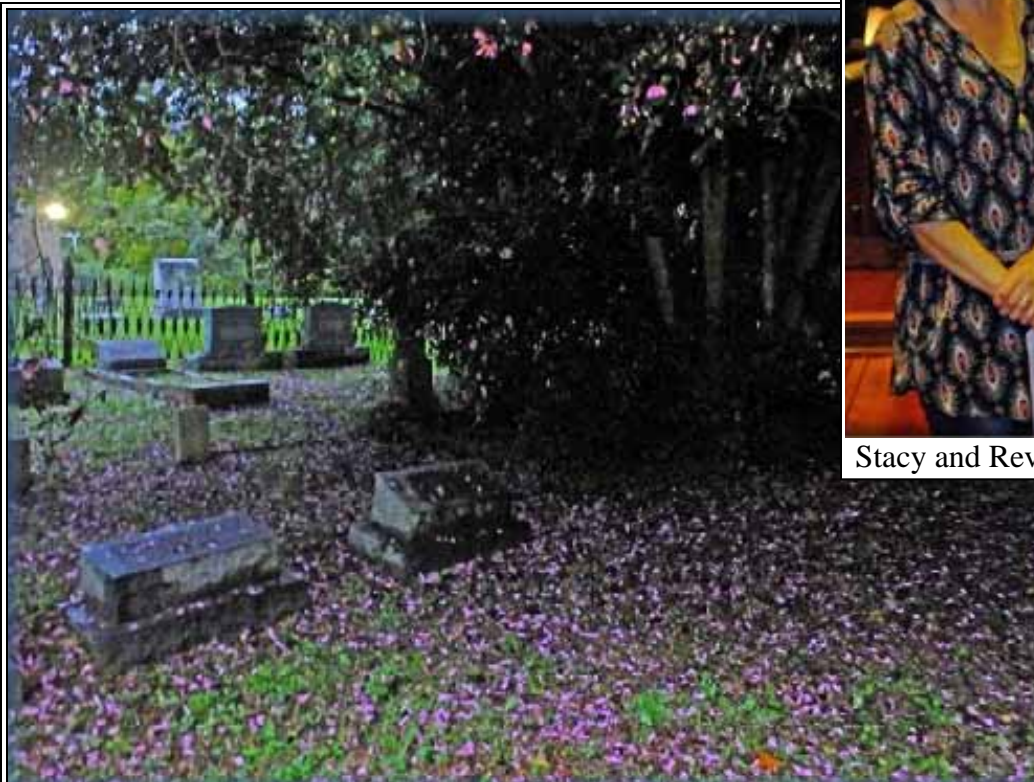
A carpet of pink petals blankets the grounds